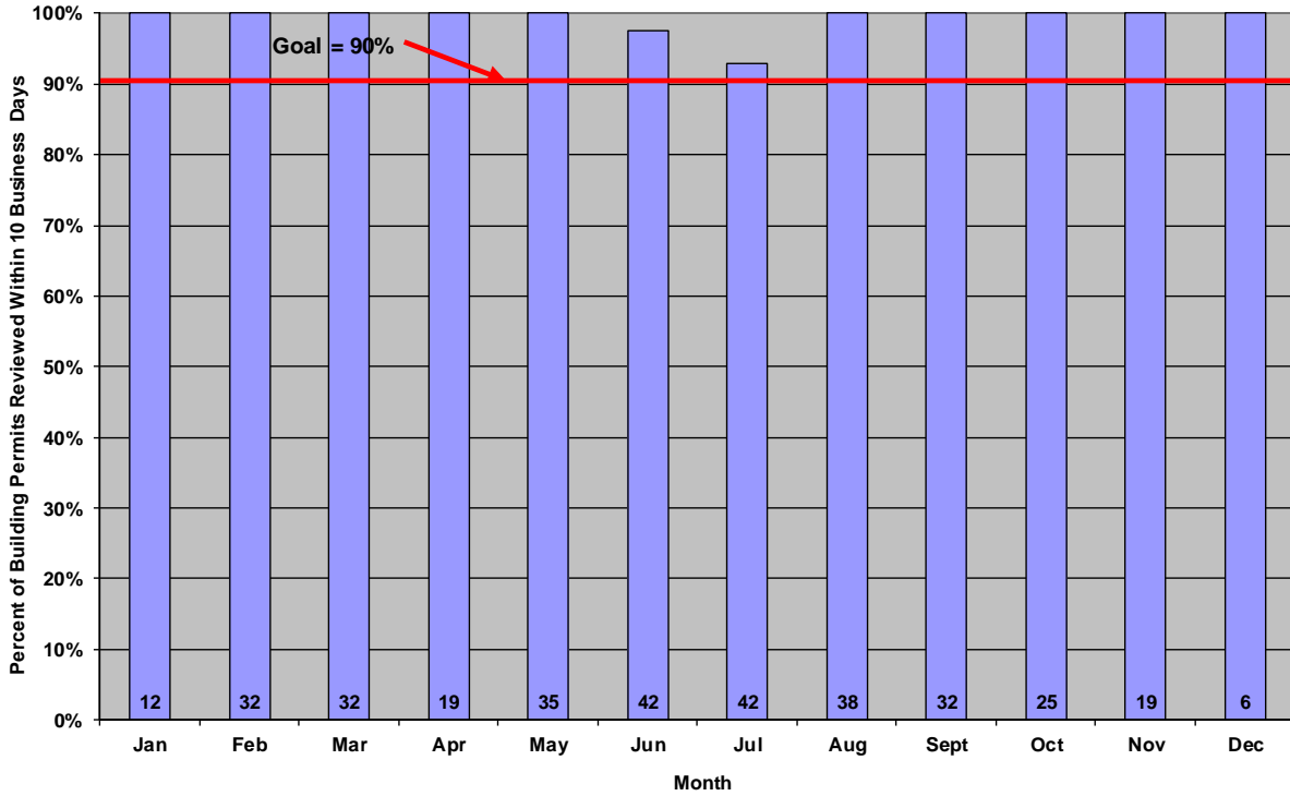
Percent of Building Permits Reviewed Within 10 Business Days