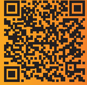
Road Closures Map*