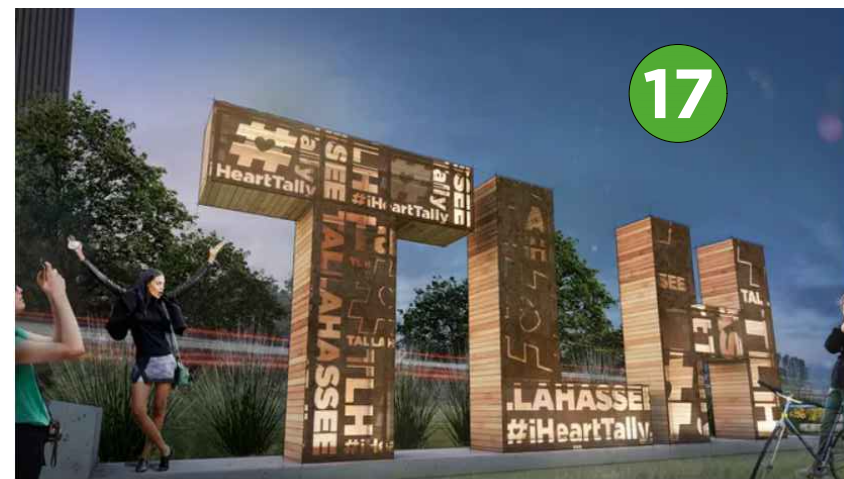
A rendering of the 'TLH' structure plan along Capital Cascades Trail, designed by Ryan Sheplak and Gosby Hayes. KCCI

Site details and future site features can incorporate Alaska cultural references, materials along with input from the Indigenous Place Names project.