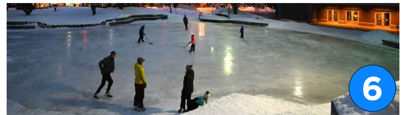
Ice skaters glide across freshly hot mopped ice at Town Square Park on Sunday afternoon, Dec. 27, 2020.