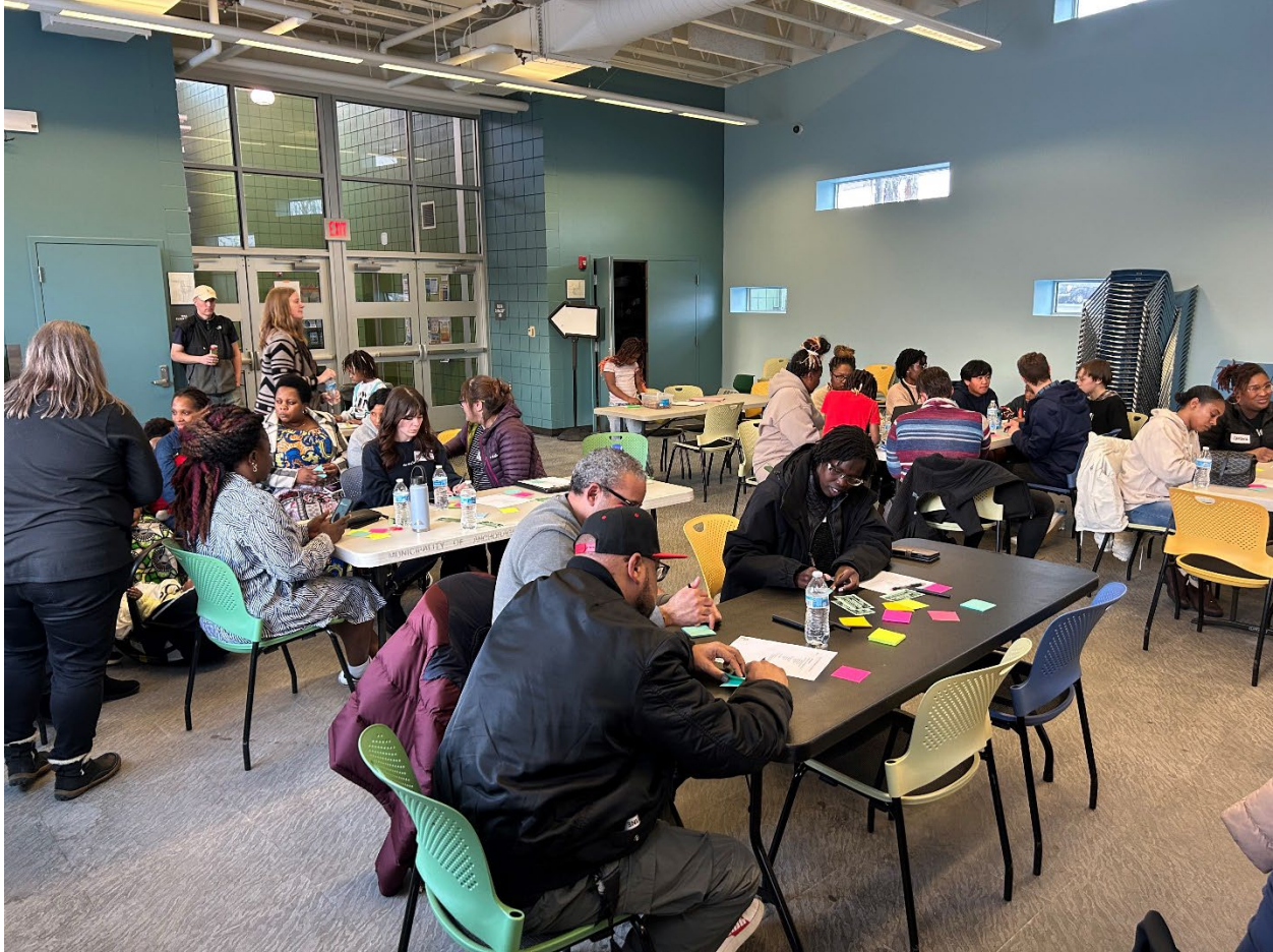
Above: Workshop at the Mountain View Library.