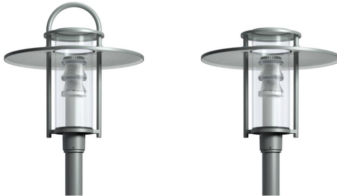
Figure 2: Phase 1 Proposed Lighting Improvements