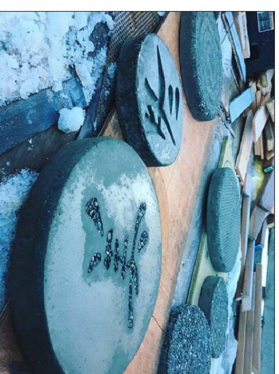
CUSTOM PAVER PRECEDENT