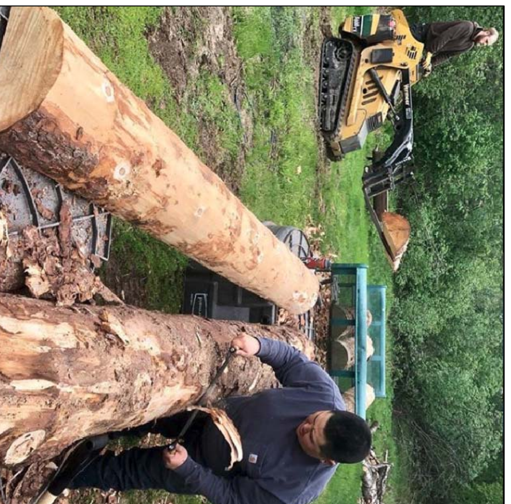
CUSTOM BENCH CONCEPT