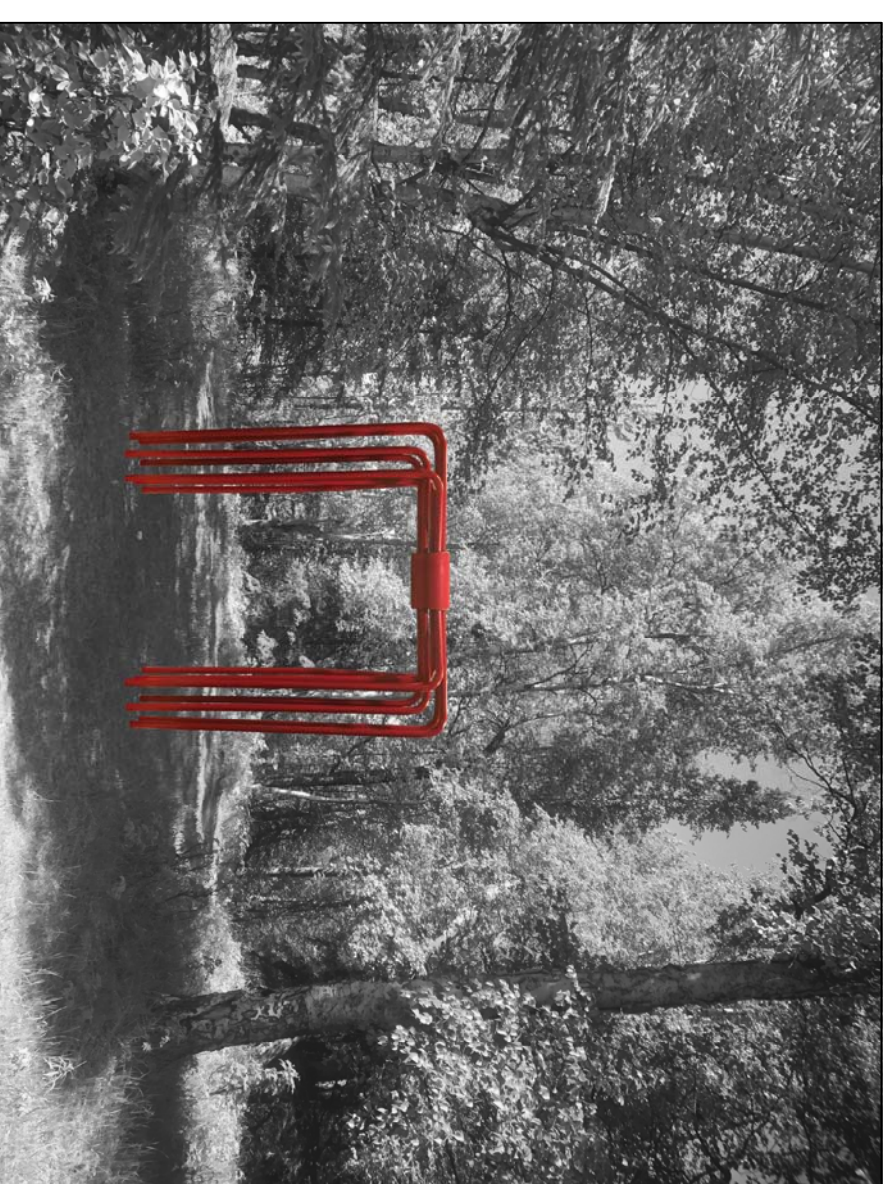
CUSTOM TORII CONCEPT