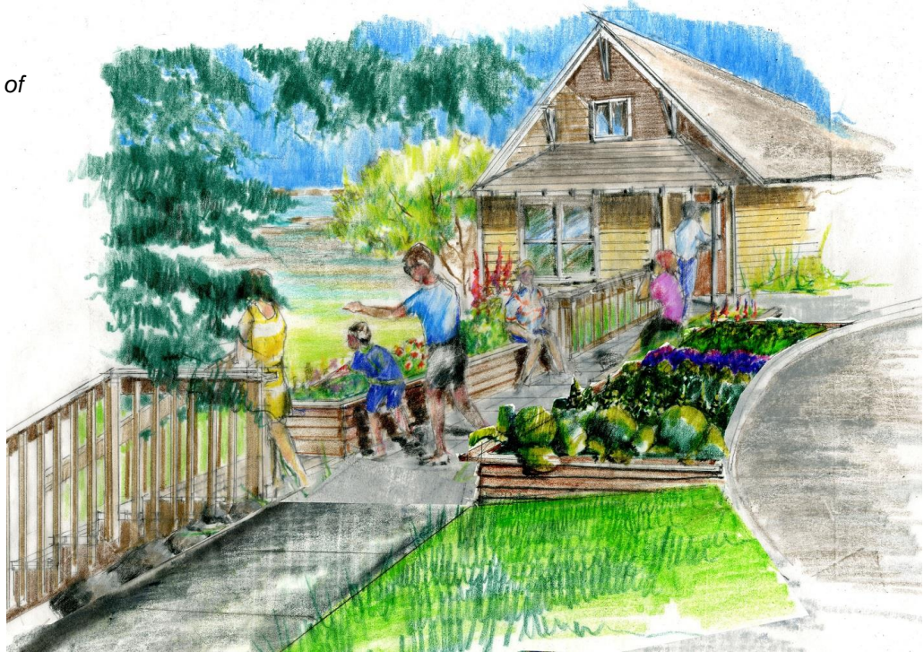
Figure 1: Illustration of ADA upgrades and Heritage Gardens