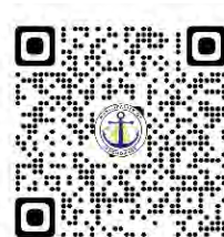
Chugiak/Eagle River Cemetery Update