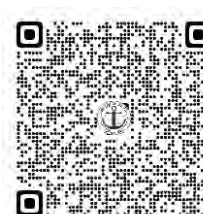
Cemetery Selection Presentation