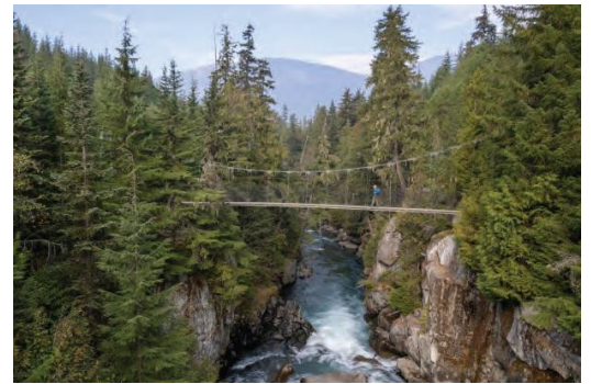
Artistic rendering of the new bridge

2025: The largest upcoming project is the suspension bridge to replace the hand tram. Full design documents are to be reviewed in February, hopefully putting the project out to bid. Although we hope to complete the project in 2025, it is more likely that disassembly and staging can be completed in 2025, with the bridge installation in 2026.