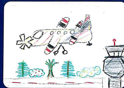
4TH PLACE: Solomarie (13)