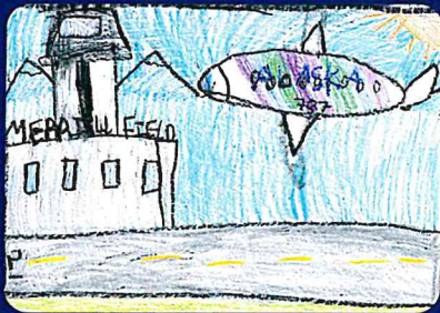
2ND PLACE: Rose G (8)