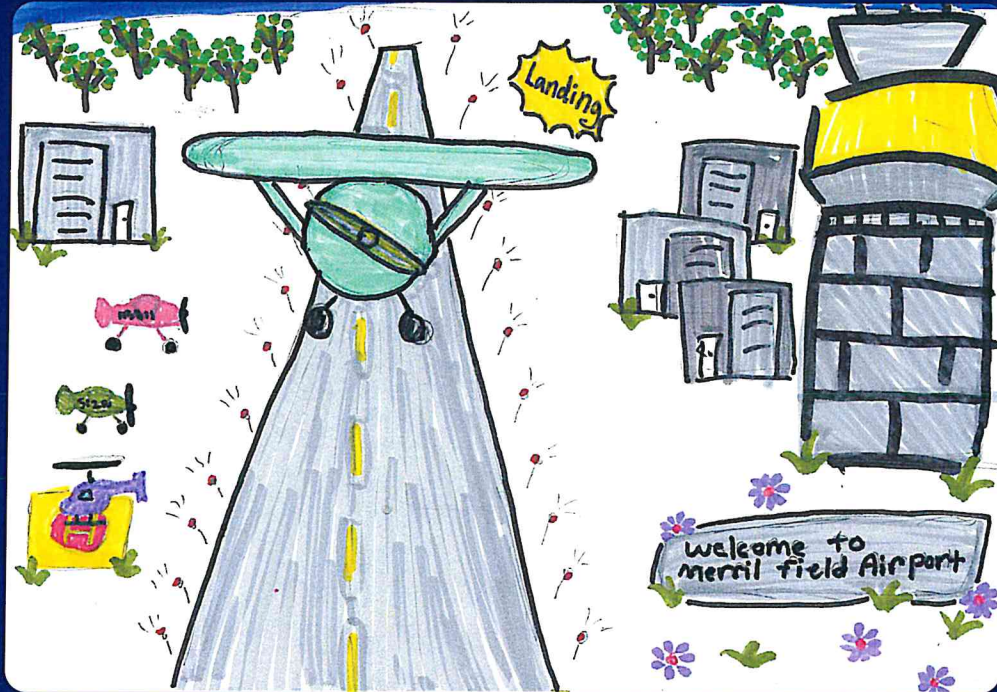
1ST PLACE: Kylee (11)