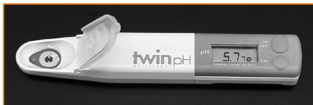
Typical all-in-one pH meter

The cost of a pH meter ranges from under $100 to well over $1,000. There are several styles that are available for purchase. Some examples are shown below.