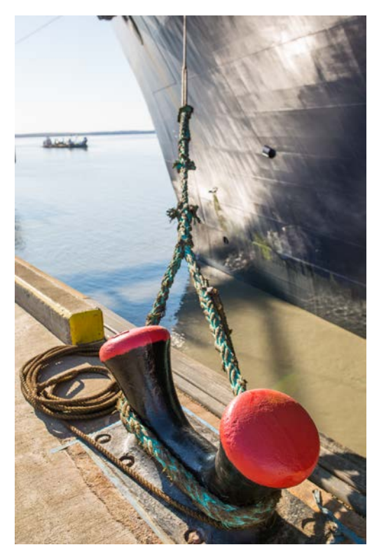
Figure 1.

The Port's Superintendent for Operations oversees all Port operations, to include all aspects of facility maintenance, vessel scheduling, movements and dockside activities, general upkeep and operation of Port facilities, infrastructure, equipment, upkeep and day-to-day management of all municipally owned infrastructure, roads, and docks. This individual also