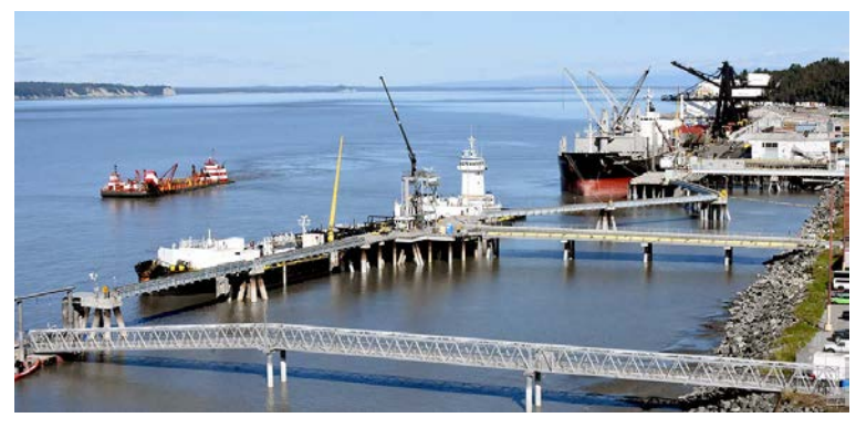
Figure 3. Port of Alaska Docks

The External Affairs section is responsible for all media advertising, coordinating public outreach and media/press relations, legislative relations coordination, any major events involving public participation, and business development. Associated duties include management of website and social media presence, coordinating all public speaking engagements, coordinating all port tours for businesses, the public and