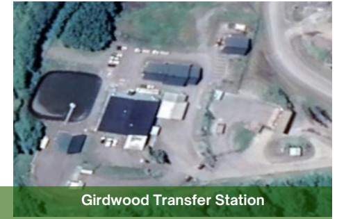
Girdwood Transfer Station