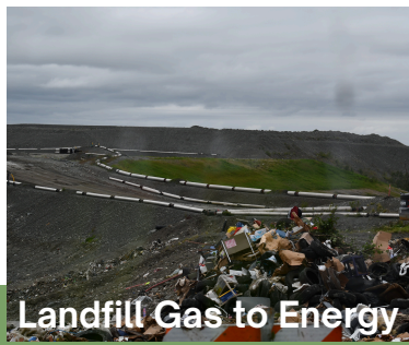
Landfill Gas to Energy