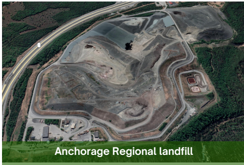
Anchorage Regional landfill