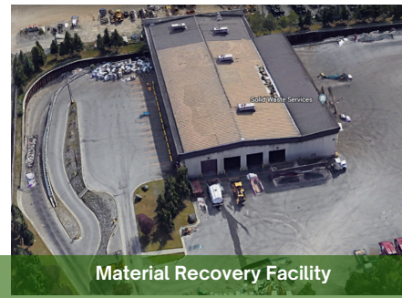
Material Recovery Facility