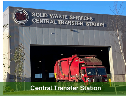
Central Transfer Station