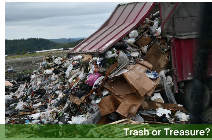
Trash or Treasure?