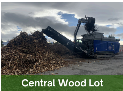
Central Wood Lot

How can we lengthen the life of the landfill?