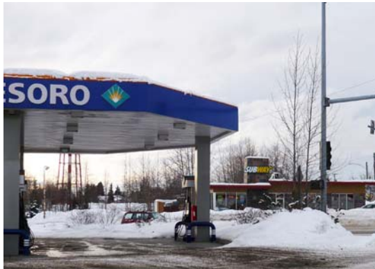
Existing Tesoro Station

More importantly, the center includes civic and institutional facilities that are shared by neighborhood residents, local employees, and those who visit the area. These include a community meeting hall, outdoor courtyards, and plazas for winter activities, as well as churches and social program facilities.