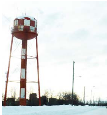
Historic Water Tower