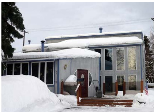
Renovated properties on Government Hill

In the future, Government Hill offers opportunities for investment in commercial and residential properties. Public infrastructure improvements have established a framework that provides a degree of certainty for investors. Homeowners continue to maintain their properties, and businesses seek out locations in the revitalized neighborhood center.