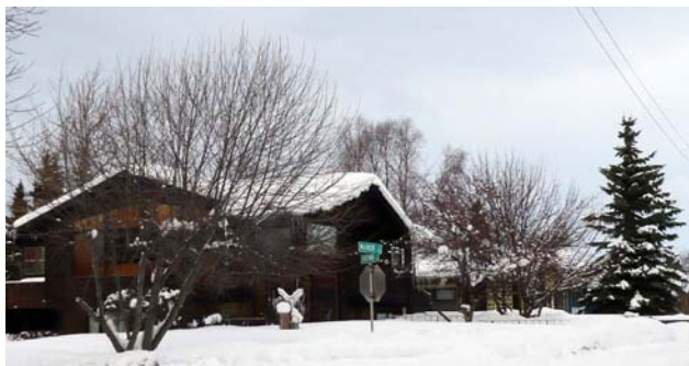
Government Hill residence in winter

The Framework Plan, depicted in the Plan Framework Map in this chapter, reflects the goals of the community as they appear in this vision statement. In meetings, interviews and community workshops, residents, property owners, and other stakeholders described features of the area they see as being important in securing continued vitality for the neighborhood. As key elements of an overarching vision for the Government Hill neighborhood, these features are summarized here as a description of the future, when the plan recommendations have been achieved.