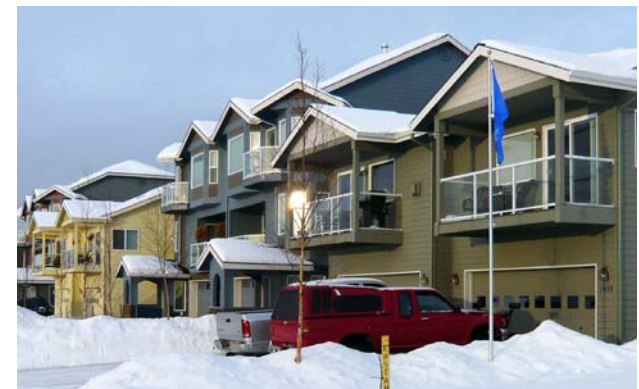
New townhouses on the bluff