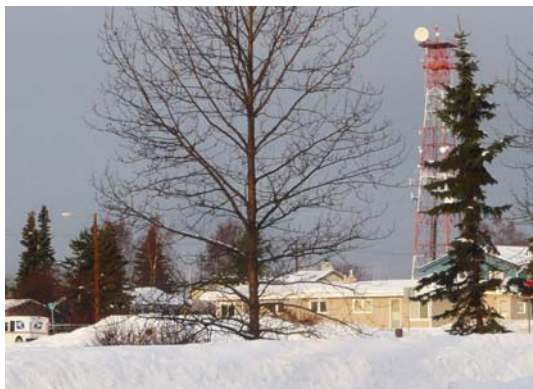
View of the wireless tower in Government Hill