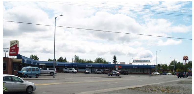
Government Hill Commercial District

While Government Hill contains sub-areas that feature distinct identities, there is an overall sense of cohesiveness, with each individual area connected to others through safe and convenient streets, sidewalks, and trails. This sense of