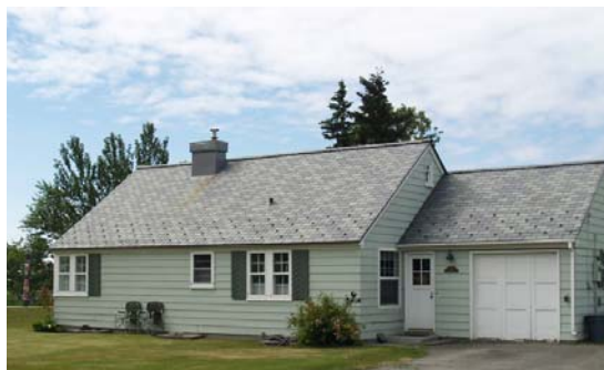
Historic Brown's Point Cottage