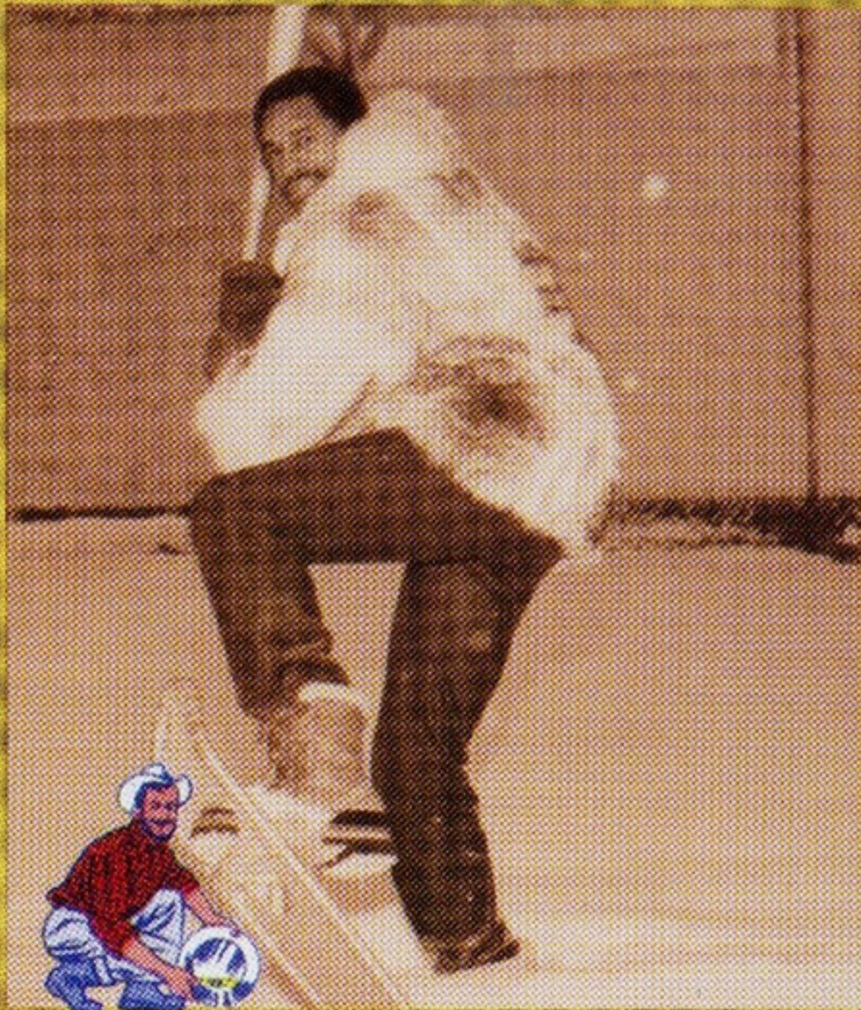
Winfield In Winter