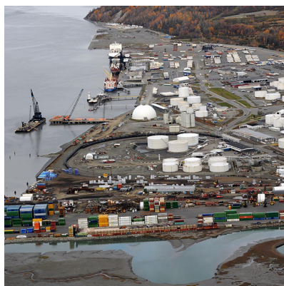
Port of Alaska