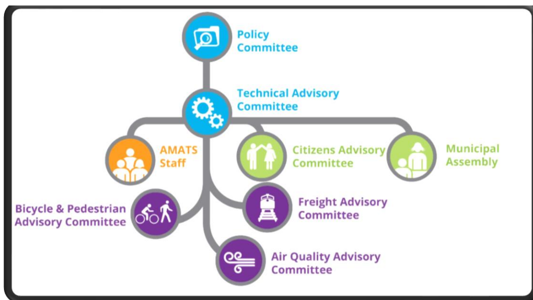
Figure 2.1 - AMATS Governing Structure

The AMATS Technical Advisory Committee consists of eleven members: the Directors of the Municipal Departments of Planning, Project Management & Engineering, Traffic, Health & Human Services, Port of Alaska, and Public Transportation; the ADOT&PF Chief of Central Region Planning and Administrative Services, ADOT&PF Regional Pre-Construction Engineer, the Alaska Department of Environmental Conservation (ADEC) Manager of the Southcentral Region Air Quality Program, a representative from the Alaska Railroad Corporation (ARRC), and the MOA Energy and Sustainability Manager. Figure 2.1 outlines the AMATS governing structure.