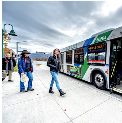
Transit Stop, Municipality of Anchorage Public Transportation Department