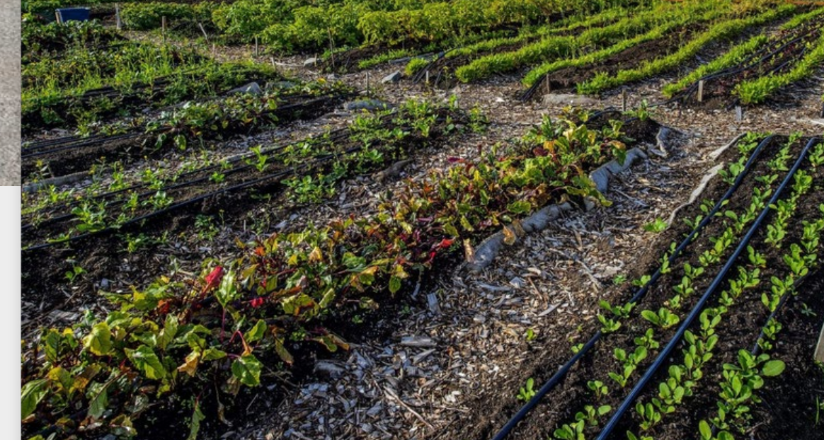
real estate transformations