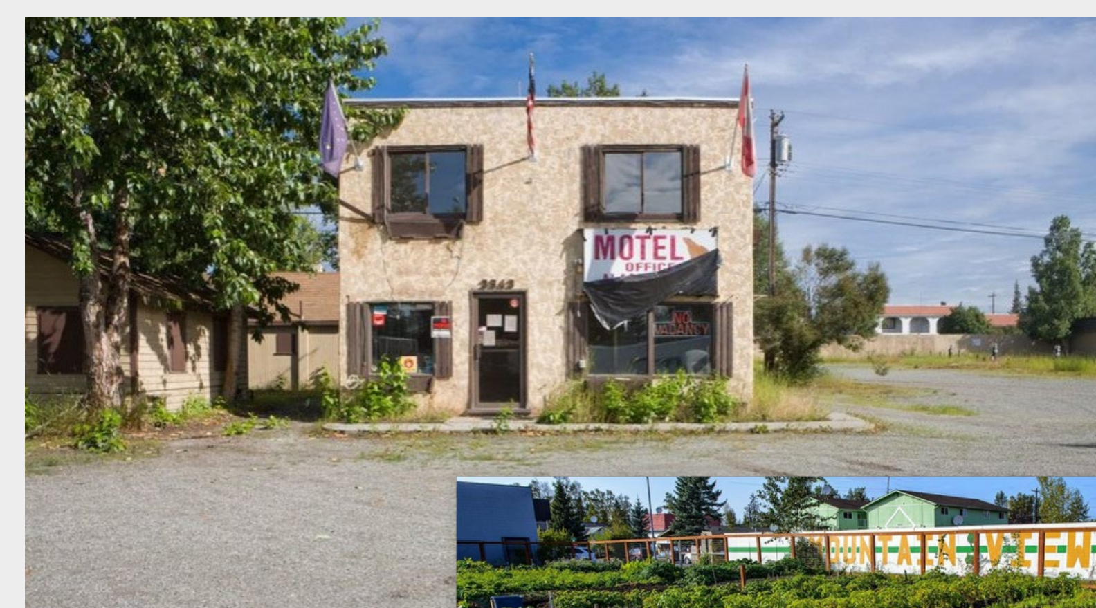
HAA FAR WOUNTAIN VIEW