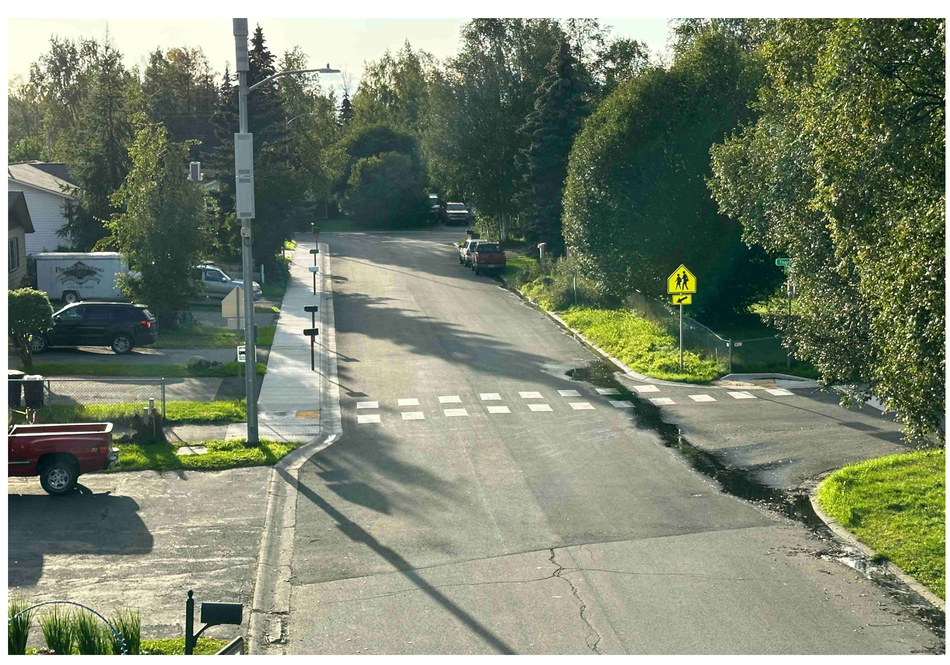
New Crossing at Lionheart Drive/Fireoved Drive and New Sidewalks on Lionheart Drive (Wonder Park Elementary School)