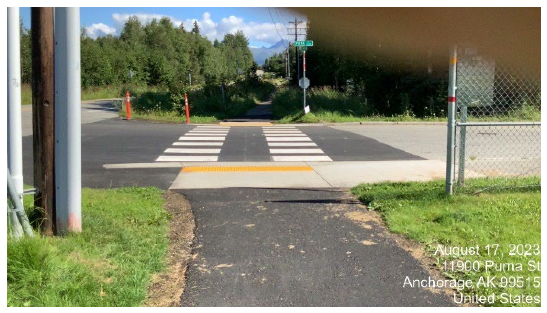
Intersection Curb Ramp and Sidewalk Repairs at Puma Street (Klatt Elementary School)