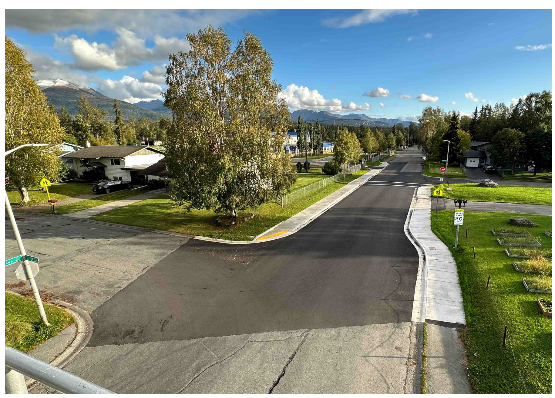
New Sidewalk on Patterson Street and Crosswalk Relocation (Chester Valley Elementary School)