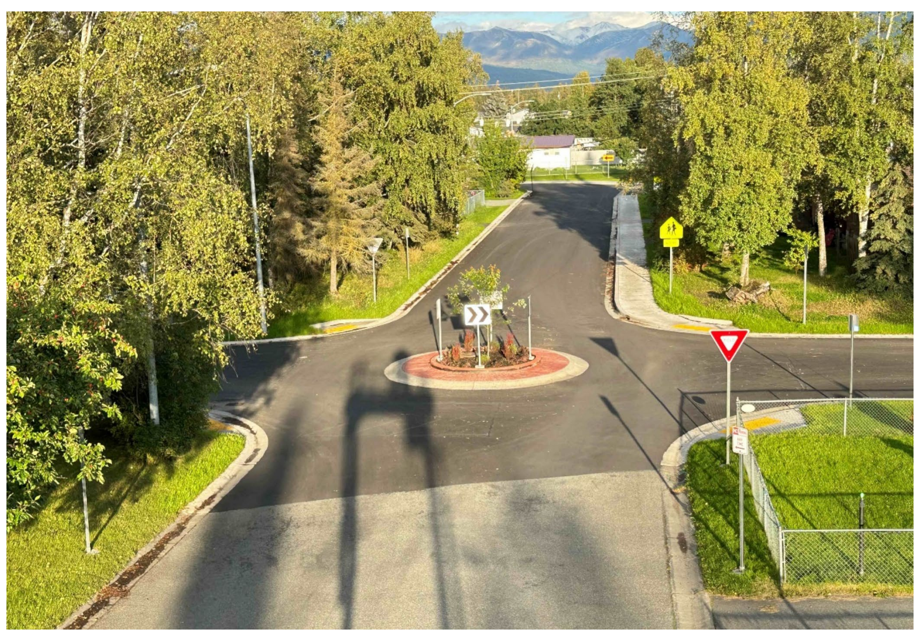
Mini Traffic Circle at Kenai Avenue/Stewart Street and New Sidewalk on Kenai Avenue (Wonder Park Elementary School)