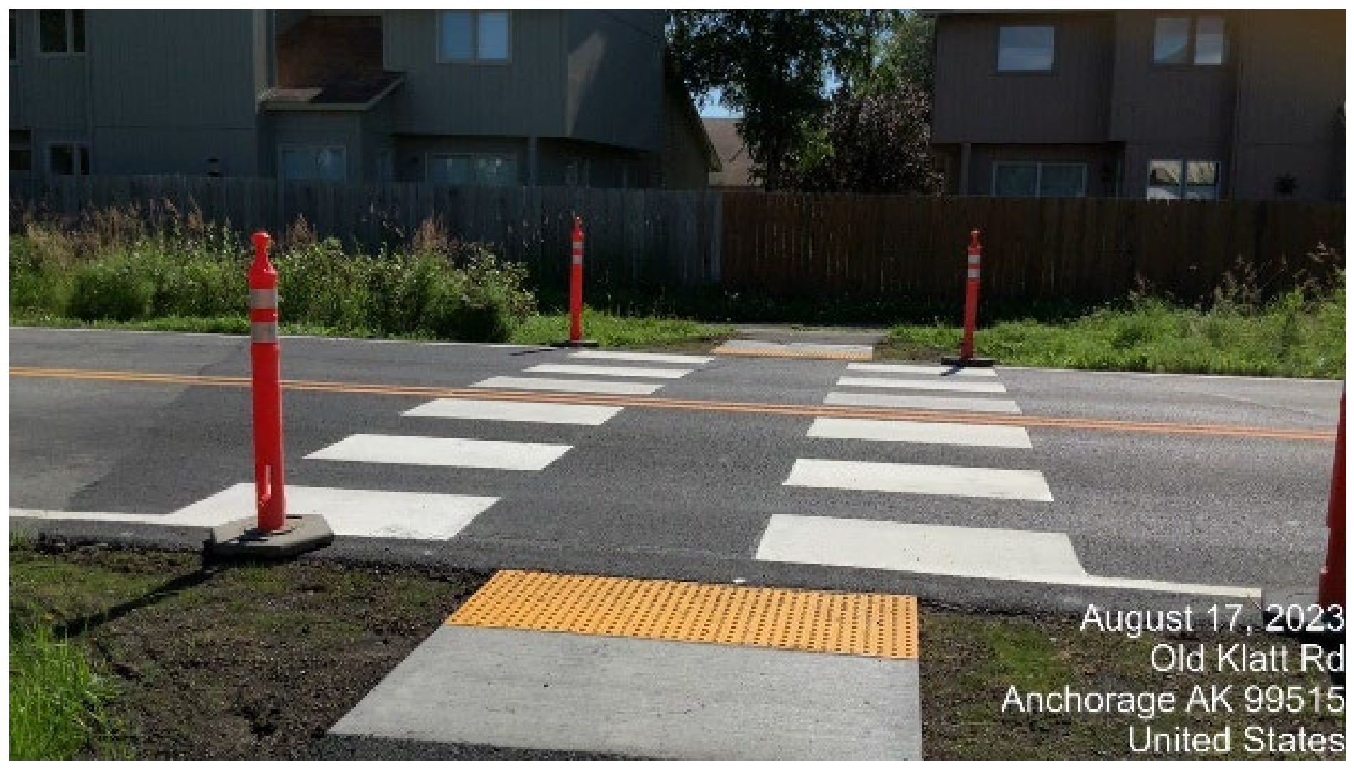
Intersection Curb Ramp and Sidewalk Repairs at Old Klatt Road (Klatt Elementary School)