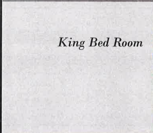
King Bed Room