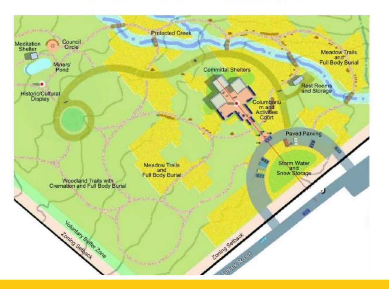
Figure 8 – Girdwood Cemetery Master Plan – Central Area and Parking