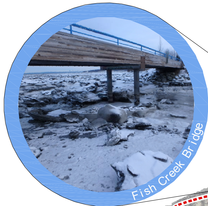
Fish Creek Bridge

Beginning May 9th the Municipality of Anchorage Parks and Recreation Department will complete replacement of two existing pedestrian trail bridges on the Tony Knowles Coastal Trail.