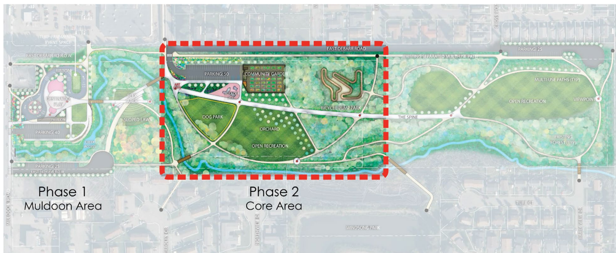
Chanshtnu Muldoon Park - Master Plan graphic showing the locations of Phase 1 and Phase 2

Chanshtnu Muldoon Park is defined by E Debarr Road to the north; Muldoon Road to the west; East 14 th Avenue right-of-way (ROW), residences and Windsong Park to the south; and Joint Base Elmendorf-Richardson (JBER) to the east. Phase 2 proposes the development of the Core Area of the park with a mix of facilities intended for use by the larger community and neighborhood residents. The Core Area encompasses the middle third of the park and is accessible from the intersection of Boston Street and Debarr Road.