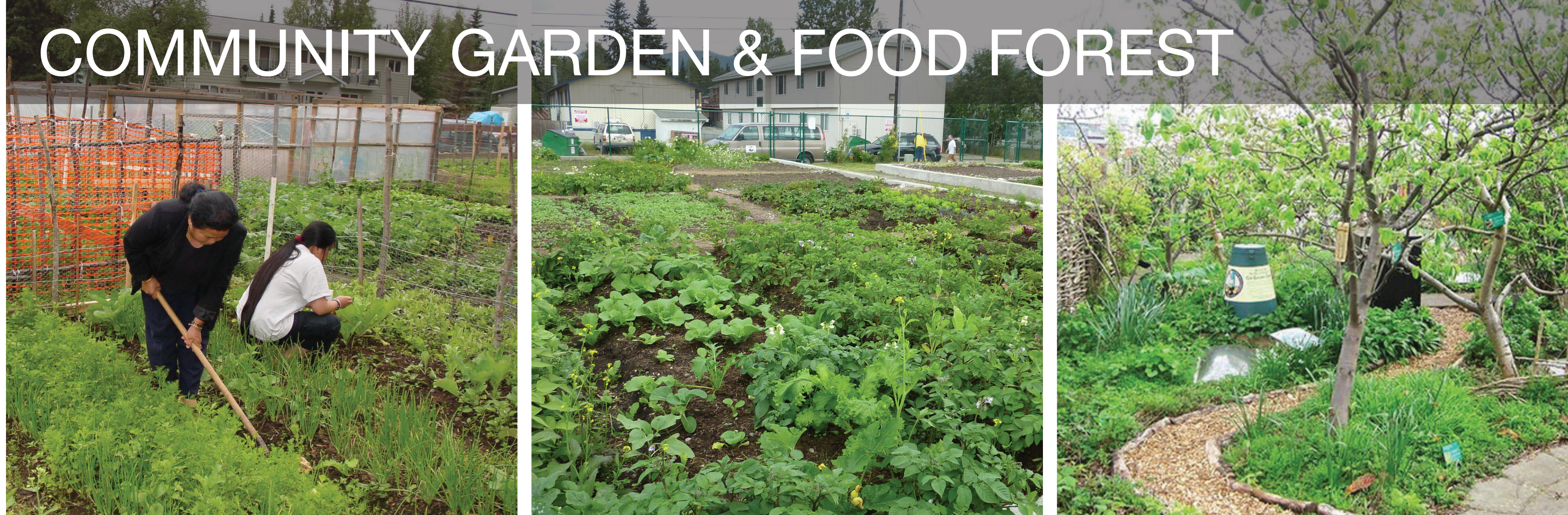
COMMUNITY GARDEN & FOOD FOREST