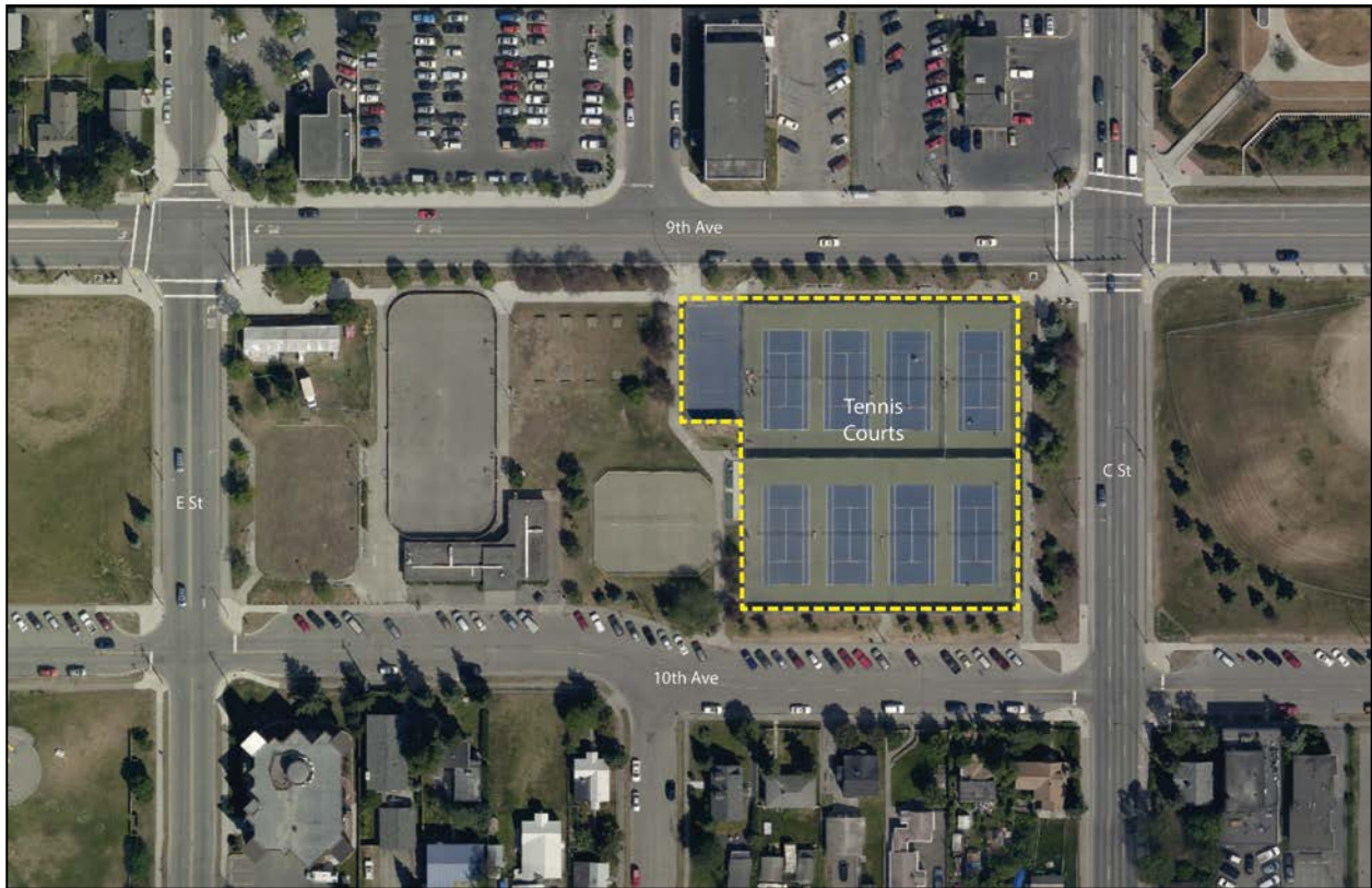
Aerial Image of Delaney Park Tennis Courts and 10 th Avenue properties