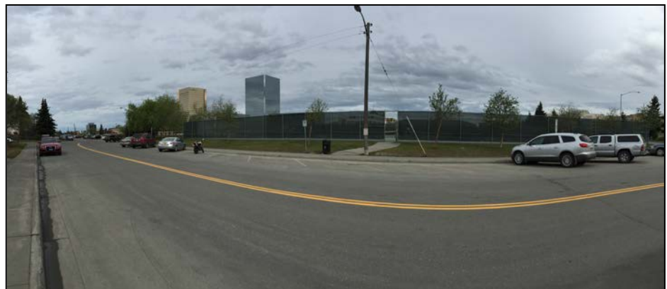
Photos of the Delaney Park Tennis Courts from 10 th Avenue taken on May 5 th , 2016.