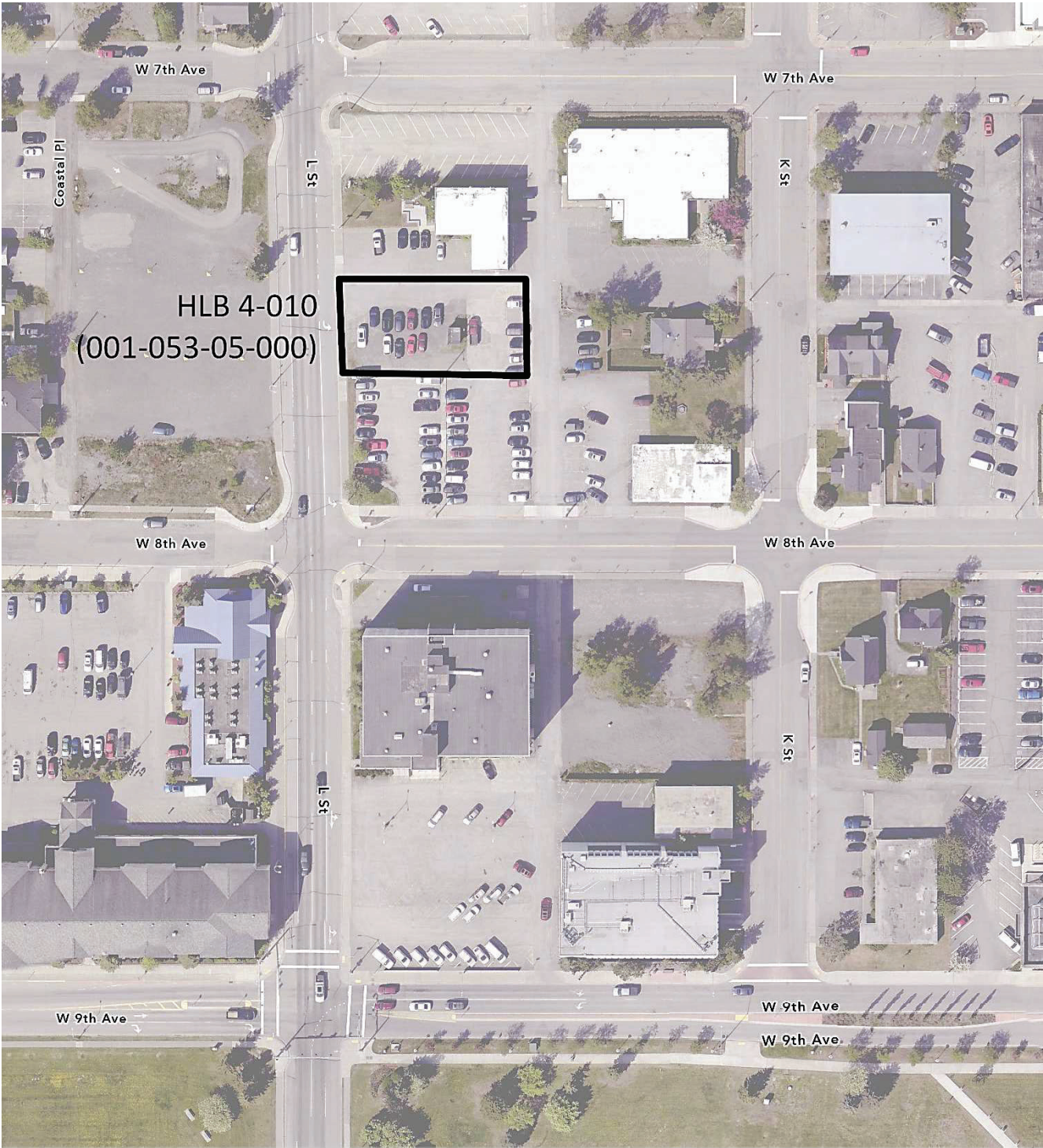
Appendix A – Vicinity Map