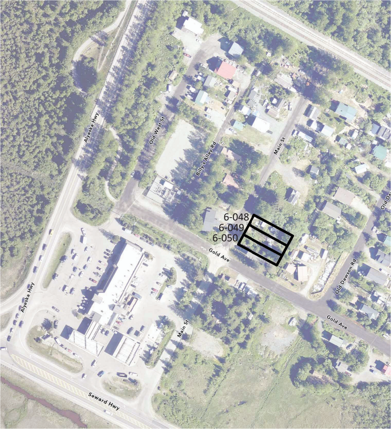
Appendix A – Vicinity Map