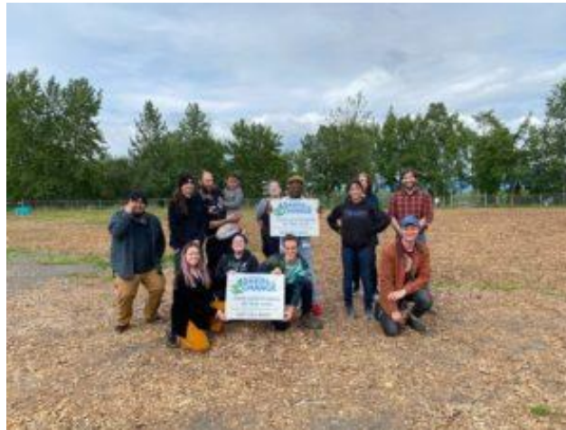
Young people and staff members gather on the site of the future Urban Sustainability Farm and Native Heritage Garden in Anchorage, Alaska.

management issues by rerouting stormwater to a vegetated infiltration basin that will become the centerpiece of an outdoor classroom.