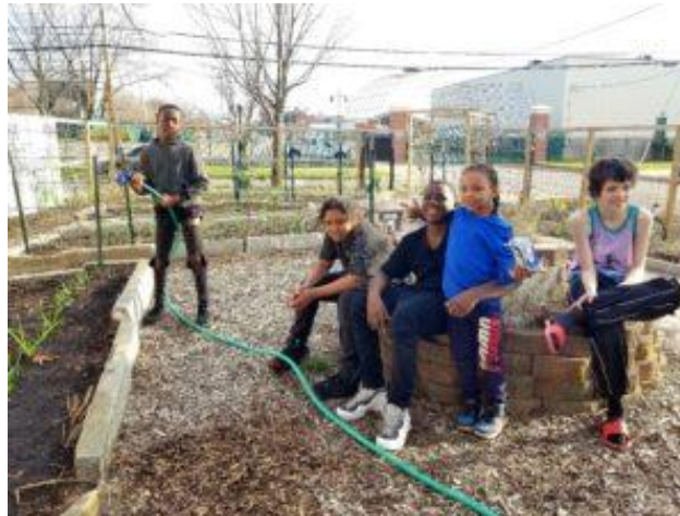
Local kids learn about seed planting in one of the community gardens established by Beechwood neighbors in Rochester, N.Y.

providing access to nutritious produce and instilling a sense of pride among residents. But mounting development pressures have prompted concerns that the community gardens may disappear. This Partners for Places grant will help fund physical improvements, crop planning, environmental education and youth employment opportunities. The gardens on city-owned land will also be purchased and entered into a community land trust, shielding these beloved community resources from development.