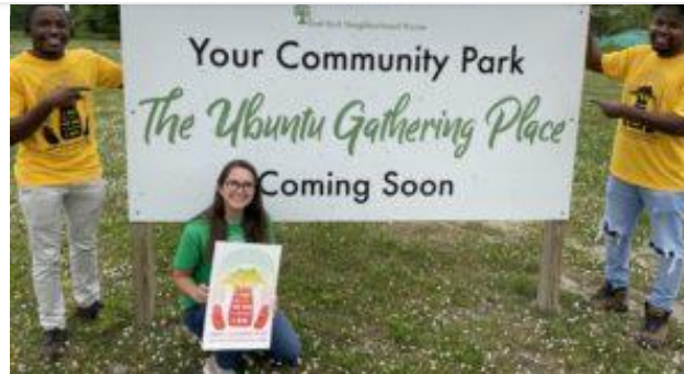
Partners for Places will help fund a new park for community gatherings in Cleveland.