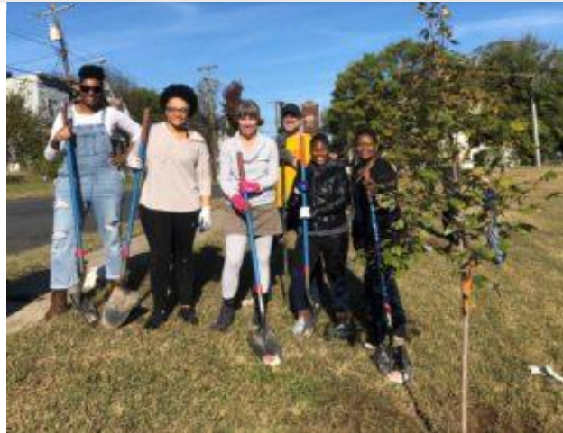
Richmond, Va., will use its Partners for Places funding for a Southside neighbor-led greening plan.

In Richmond , where decades of disinvestment and inequitable policies have created drastic climate-related inequities such as heat-related illnesses in the Southside neighborhood, Partners for Places will help fund a neighbor-led greening plan that addresses the root causes of climate injustice and restores decision-making power to Black and Latinx communities that have historically been marginalized in city planning and environmental projects.