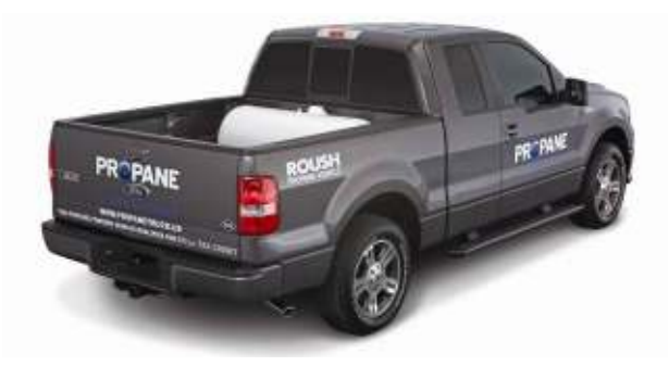
Ford F-150 2007 ½ & 2008 Model Year 5.4L V8 (3V)