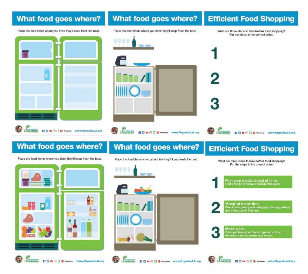
Figure 2: Food Waste Reduction Activity Examples (Top: Question templates; Bottom: Answers)

To track progress, a combination of visual inspections, waste characterization, and survey methods were used. Visual inspections were spot checks of black and green bins on randomly selected sections of pilot routes to look for signs of participation, such as food scraps in the green bin. Visual inspections also provided an opportunity to gauge contamination. Green bins with high amounts of contamination (greater than 25% by volume based on a visual estimate) were marked with contamination tags to remind residents which items do not belong in the green bin. Waste characterization involved collecting and sorting samples from green bins and black bins into material categories to estimate the diversion rates before and during the program. Visual inspections and waste characterizations were conducted in tandem, with the first event before door-to-door outreach began to establish a pre-pilot baseline (April 2019). Subsequent events took place in August 2019, January 2020, and July 2020. Surveys were conducted with randomly selected residents to measure residents' attitudes and behaviors and provide program feedback. The first survey was conducted during door-to-door outreach in May 2019. Subsequent surveys were conducted in August 2019 and January 2020. The last survey in July 2020 was not conducted due to the COVID-19 pandemic.