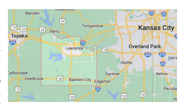
Figure 3: Douglas County, Kansas

Located between Topeka and Kansas City, Douglas County has a population of approximately 120,290 according to the 2019 American Community Survey (ACS) five-year population estimate. It is the fifth-most populous county in Kansas, with Lawrence being the largest city with a population of close to 95,000 and is home to University of Kansas (28,000 students) and Haskell Indian Nations University (150 students), the only inter-tribal university for Native Americans in the US. The County has a total area of 475 square miles with its northern boundary defined by the Kansas River.