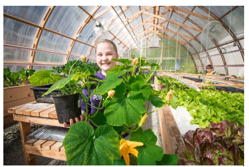
Figure 11: Student in a Gothic Arch greenhouse

Lettuce is the main crop grown in all the greenhouses, which is sold to the school cafeterias for their salad bars as well as to the school's district cafe and local grocery stores. Other vegetables are rotated seasonally and based on the choices of the teachers, students, and school curriculum. These vegetables have included greens (e.g., kale, basil, chard) and root vegetables (e.g., carrots, turnips, radishes).