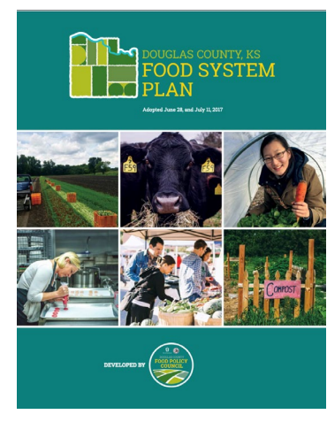
Figure 5: Douglas County Food System Plan, 2017

Urban Agriculture Laws, 2022 updated . Building on a 2012 Lawrence Chicken Ordinance to permit backyard hens for egg production, the City of Lawrence passed updated urban agriculture laws to permit limited numbers of goats and sheep, bees, other animals including crustaceans, insects and fish, and crops. Parameters were also set for agricultural sales of unprocessed goods and urban farms, which require a permit once beyond a certain size. <sup>18</sup> An Urban Ag 101 booklet and a one-page policy summary brochure provide more specifics to support residents to produce local, healthy food at home and create opportunities to pursue commercial production. <sup>19</sup>