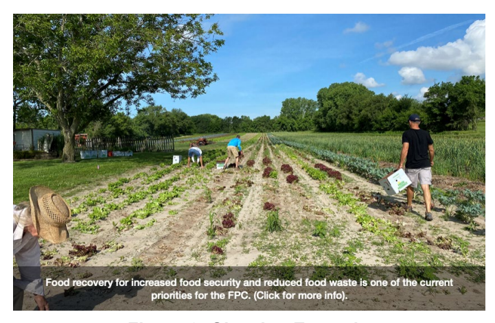
Figure 6: Gleaning Example

Several key groups are collaborating to optimize onfarm gleaning including After the Harvest <sup>23</sup>, an established Kansas City group, a locally formed group called Community Organized Gleaners, and Douglas County Sustainability who is working with several organizations including Just Food, Lawrence Community Shelter, Sunrise Project, and KU Center for Environmental Policy. They have successfully recruited volunteers and recovered thousands of pounds of food to local food pantries over two growing periods, July to October 2020 and May to December 2021. This is one of thirteen related initiatives funded by the USDA through a two-year Community Compost and Food Waste Reduction Grant.<sup>24</sup>