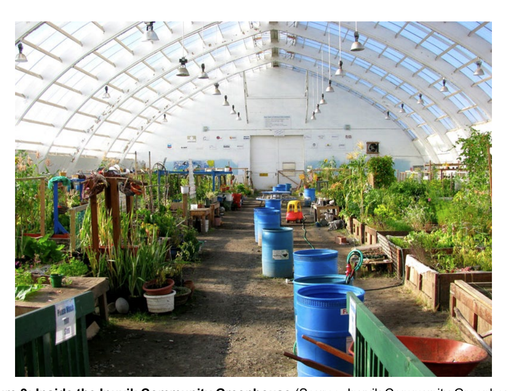
Figure 9: Inside the Inuvik Community Greenhouse

The arena was used as the base structure of the greenhouse. The tin roof of the arena was replaced with translucent polycarbonate glazing with a ridge vent along the length of the roof.<sup>39</sup> The garden plot area is built over gravel to prevent cold transfer from permafrost below and each plot is insulated. The building has two floors. The main floor contains the community and family garden plots. The second floor has a commercial greenhouse operation. The greenhouse is primarily heated by sunlight since the sun shines close to 24 hours per day in the summer, which keeps the inside of the greenhouse 10 degrees Celsius (18 degrees Fahrenheit) warmer than outside temperatures. Additional heat is used in the early growing season. There is also a composting facility on site that collects organic material from the greenhouse and community. The compost is then used by the greenhouse as an organic, nutrient rich soil amendment that also saves cost of flying in soil and compost.<sup>40</sup>