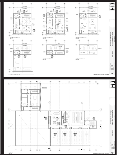
Practical Applications Building, 2nd Floor