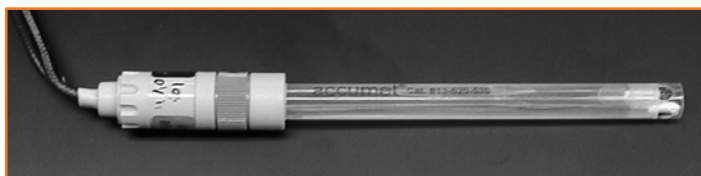
Typical pH meter probe