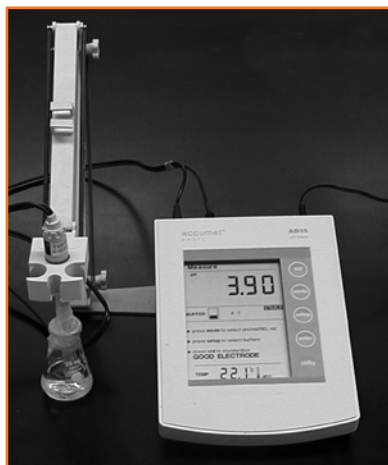
Typical pH meter with detachable probe