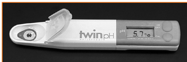
Typical all-in-one pH meter

The cost of a pH meter ranges from under $100 to well over $1,000. There are several styles that are available for purchase. Some examples are shown below.